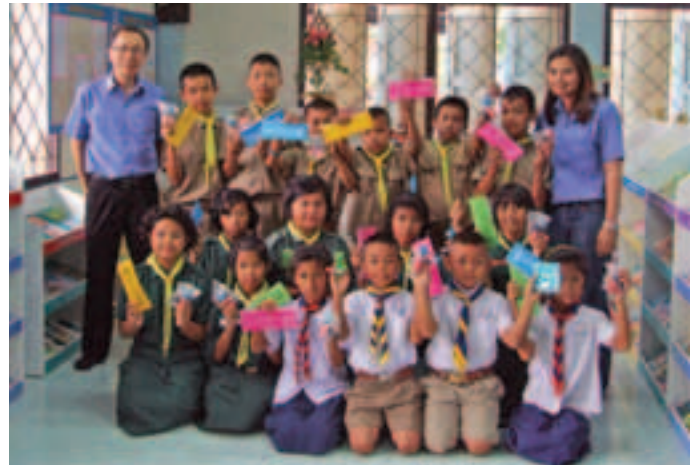
'Grow Smart with Tata Steel' in Thailand.

Tata Steel-promoted rural enterprise development helps women to find new employment opportunities.