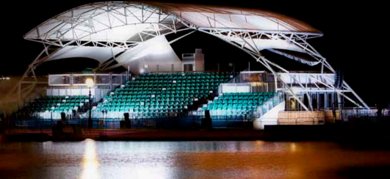
Tata Steel's specially-commissioned steel stand in Hyde Park, location for the London 2012 Olympic Games triathlon competition.

Throughout its long history, the Tata Group has been recognised as an organisation committed to good corporate citizenship – long before the term was invented. This philosophy was encapsulated by its founder, Jamsetji Tata (1839-1904), who viewed the creation of wealth not as an end in itself, but as the means by which his company could make a positive contribution to the communities it served.