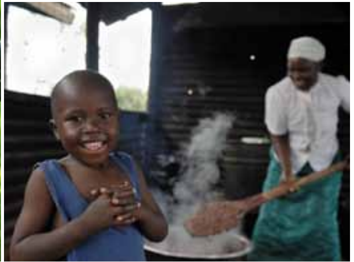
Community projects at home and in Kenya supported by employees from IJmuiden.

We support a number of sports clubs in the Netherlands and the UK to encourage participation and help employees maintain and improve their health. These include 'Start to Run' workshops organised by the Tata Steel Runners Club. There are also active rowing and Dragonboat racing clubs. In Wales the annual 'Beast of Bryn' endurance running event is sponsored by the Port Talbot plant.