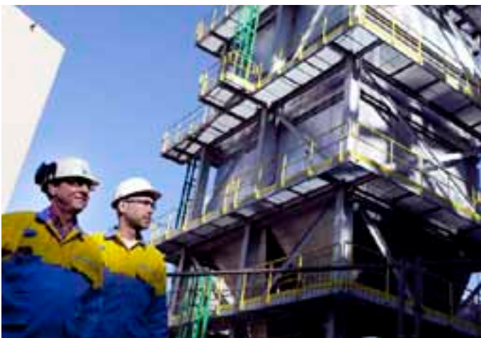
New filter technology at IJmuiden, the Netherlands.

emissions increased slightly in 2010/11 compared to the previous two years, whereas direct emissions decreased slightly in 2010/11 compared to the previous two years. These effects are also explained by the cessation of steelmaking at Teesside in 2010/11. Steelmaking at Teesside was characterised by relatively low indirect emissions, as the site had little downstream processing of steel and was able to produce a large proportion of its own electricity. In contrast, IJmuiden, which made a greater contribution to the Group’s total crude steel production in 2010/11 than in the previous years, is characterised by relatively high indirect emissions, because the power plant where the blast furnace gas is converted into electricity is owned by a third party and so according worldsteel definitions this is regarded as indirect emissions.