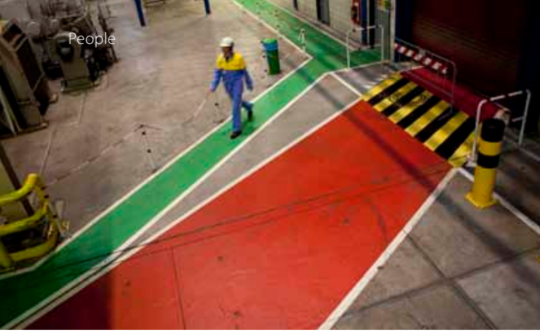
Safe walkways at Umuiden, the Netherlands.