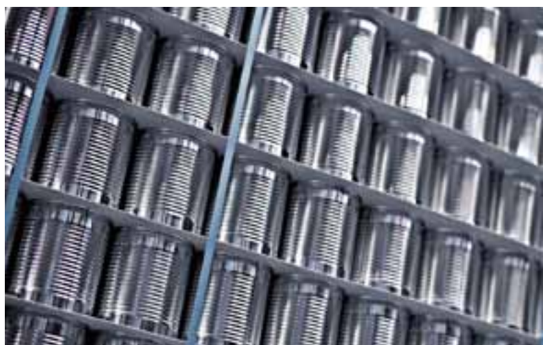
We have implemented a purchasing policy for tin.

the mines where the iron ore is originally sourced. Recertification was secured in 2011.