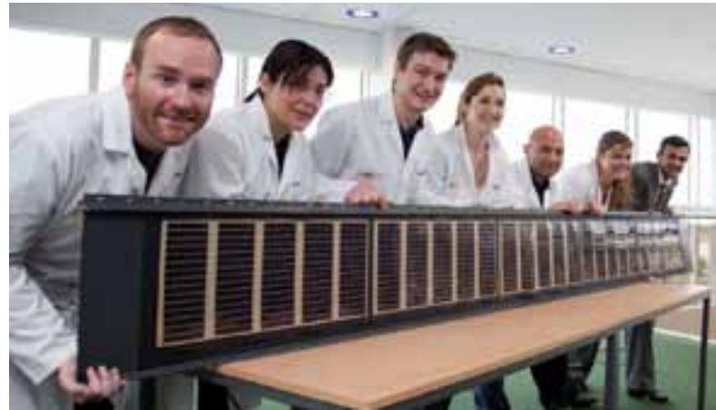
The world's largest dye sensitised photovoltaic module, a big step in the development of micro energy generation within buildings, achieved through a development partnership between Tata Steel and Dyesol.

reduction; this will be enabled by a new 'One Company' operating model involving a single sales and marketing team, consolidated supply chain organisation with three steelmaking hubs, speciality businesses and pan-European support functions