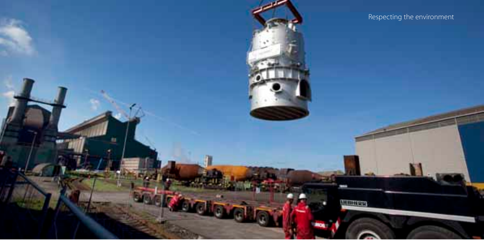
The 95-tonne Hlsarna furnace being lowered into place in IJmuiden.