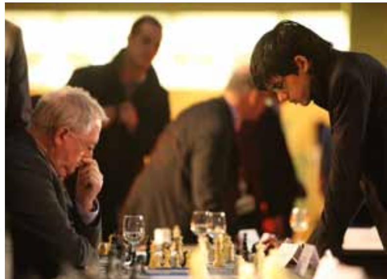
The Tata Steel Chess Tournament in the Netherlands.

As in previous years, we donated products and construction materials to temples, schools, and local government agencies. Our employees continue to support a number of non-profit organisations caring for the elderly and orphans. They also supported a community initiative by