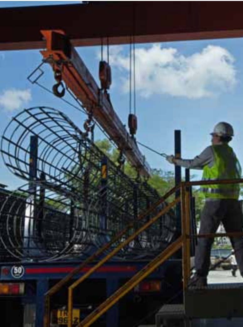
Safe loading at NatSteel, Singapore.

A Safety Excellence Journey has set out standards and procedures and resulted in many improvements to processes, visual management and communications – all helping to raise awareness and foster a culture of safety. A 100-day Safety Excellence Journey campaign included safety training for senior leaders, and a ‘train the trainer’ programme for 24 plant managers. Safety training has been held on specific topics such as working in confined spaces, fire and gas, with a special focus on contractor safety management.