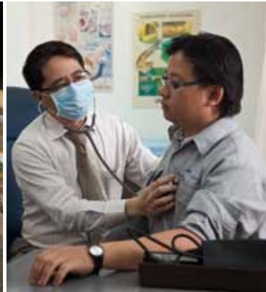
Health at work – daily exercises (left) and a health check-up at NatSteel, Singapore.

We also believe as a matter of principle that diversity within our workforce greatly enhances our overall capabilities. In all our operating locations globally, we are an equal opportunity employer. We do not discriminate on the basis of race, caste, religion, colour, ancestry, gender, marital status, sexual orientation, age, nationality, ethnic origin or disability. All decisions relating to promotion, compensation and any other forms of reward and recognition are based entirely on performance.