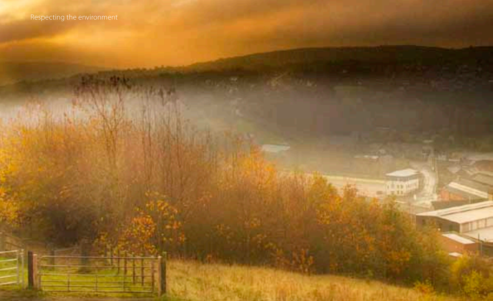
The site at Stocksbridge, UK, which in November 2010 received a £6.5 million investment to increase production of aerospace steels.

Phase II of the project (2011-2015) further explores the breakthrough technologies identified and aims to demonstrate their feasibility under large-scale, industrial production conditions. If successful, the technologies could potentially be in use in 15-20 years.