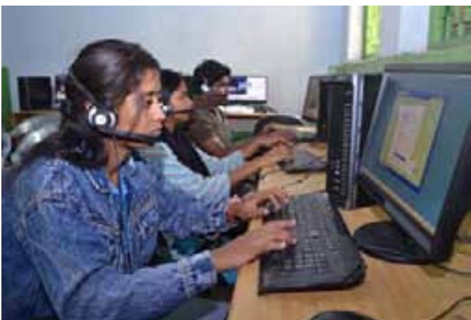
Job-oriented training for young people in India.

In the vital area of health we are concerned with a large number of preventive and curative health services, with the emphasis on maternal and infant survival projects and HIV/AIDS interventions. During the year, more than 213,000 people benefited under outreach programmes through our mobile medical vans, clinics and health camps in and around Jamshedpur and other locations. Nearly 9,900 babies were immunised and 8,700 family planning operations carried out. In 2010/11, Tata Steel hosted the Life Line Express hospital train for the 16th time at Jajpur, Odisha. Through this project, more than 525 procedures were carried out including orthopaedics, ENT, eye, reconstructive and dental work.