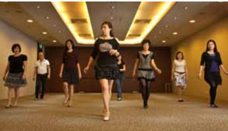
Line dancing for fun and fitness - employees from NatSteel, Singapore.