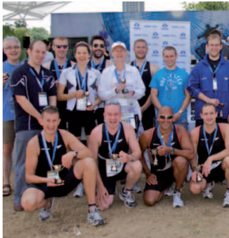
Encouraging triathlon in the UK.

In sport, a cycling team representing Jharkhand and supported by Tata Steel won a bronze medal at the 34th Indian National Games in the 500m team event.