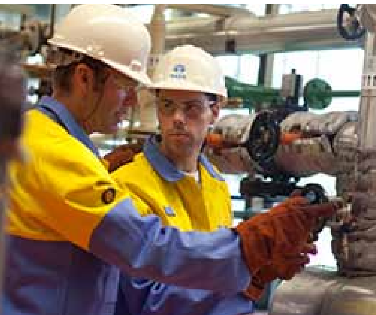
Creating a passion for continuous learning through the Tata Steel Academy.

UK Steel Enterprise was formed 35 years ago to help improve the economies of areas most affected by changes in the UK steel industry. During that time it has helped to create nearly 70,000 jobs and supported more than 4,650 small businesses. UK Steel Enterprise provides support to steel communities through the provision of investment finance and managed work space for businesses. In the last year it has given almost £1 million of financial assistance to community support projects within steel communities.